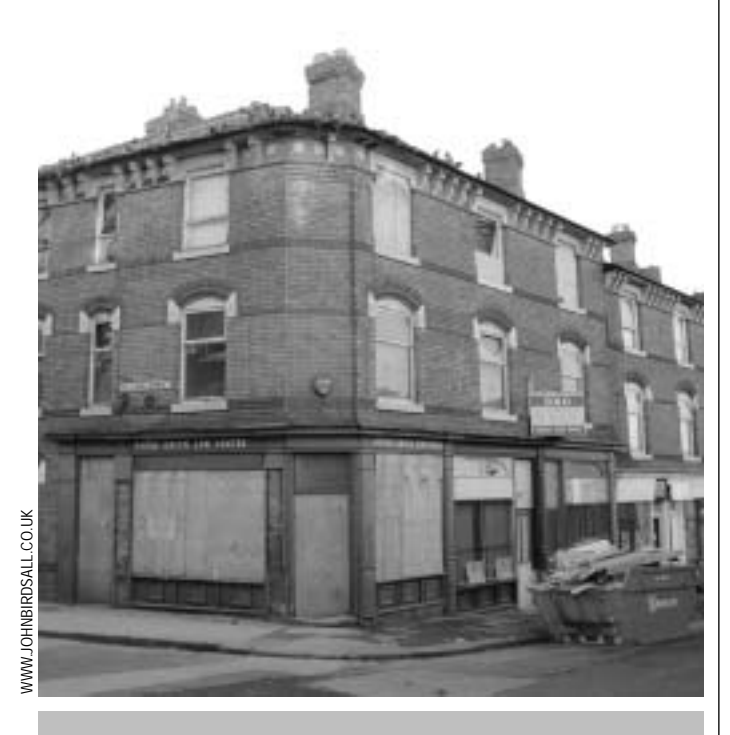
Taking account of the value of housing lowers the risk of poverty for older households