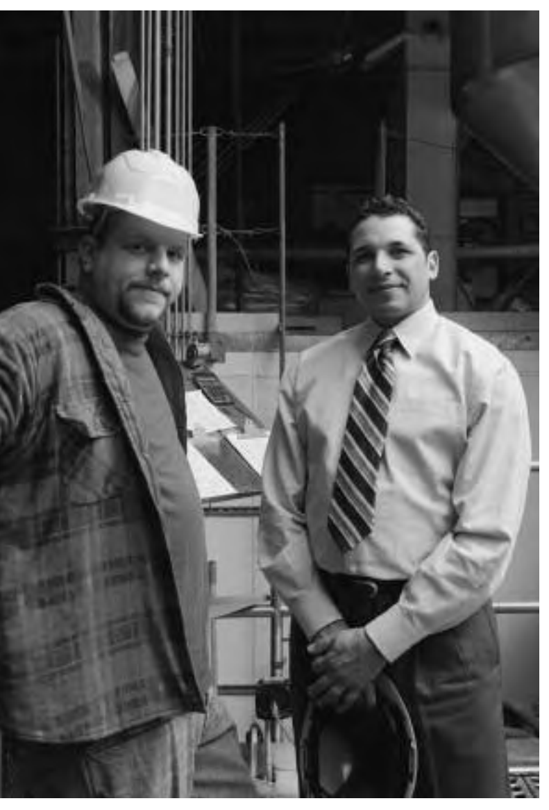
The panel study allows us to track movements continuously throughout the life-course – and provides unexpected insights, for example, into differences between men's and women's social mobility.

It is sometimes said that we have become a 'classless society'. Over the 60 years since the Second World War the number of middle class jobs like teachers and computer programmers has massively expanded, and the number of working class jobs like farm labourers and miners has shrunk. Average earnings have multiplied, and with so many married women in the labour market, family incomes have increased even faster. These absolute trends, promoted by the availability of education as well as by global economic forces, have benefited us all.