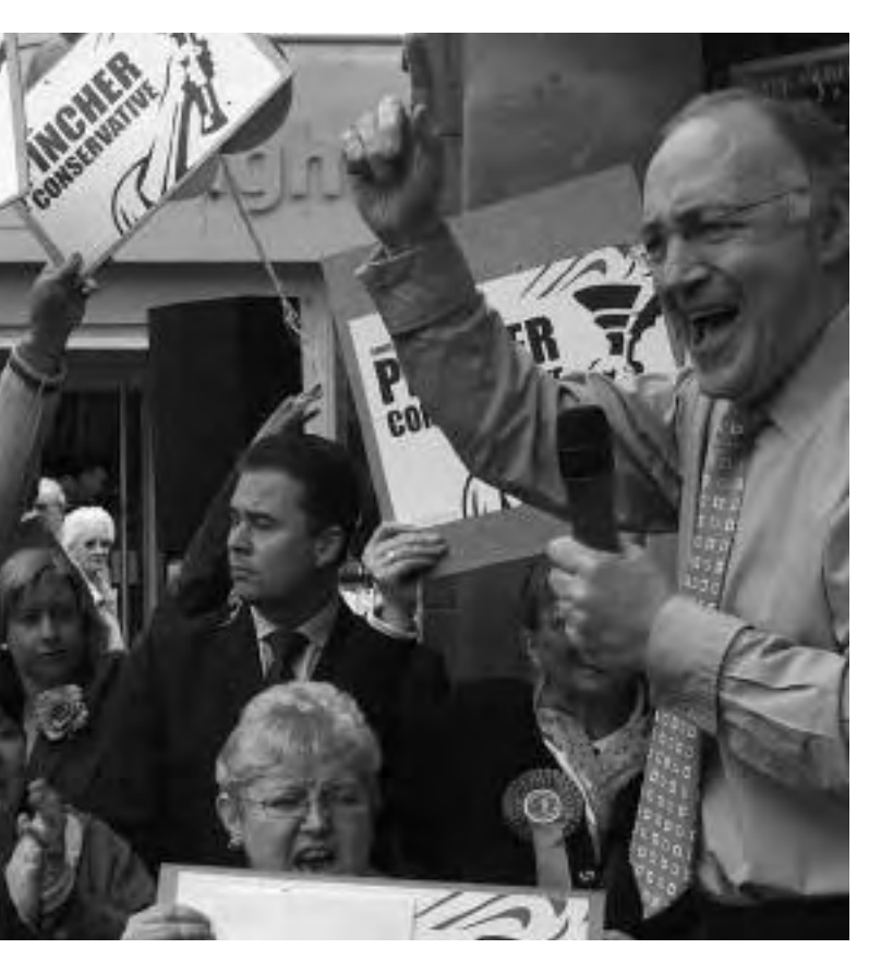
From many perspectives, the BHPS provides better data on political decisions than election surveys do.

Let us now praise panel surveys. Whereas surveys at the cross-section typically assume that choices at any one time are explained only by factors that occur simultaneously, panel surveys permit analysis to examine choices at any given time in the context of decisions made at an earlier time. As important, panel data permit tracing and explaining choices taken at different points of time. Applied to the study of political behaviour, panel surveys provide appropriate data on decisions about political parties and vote choice.