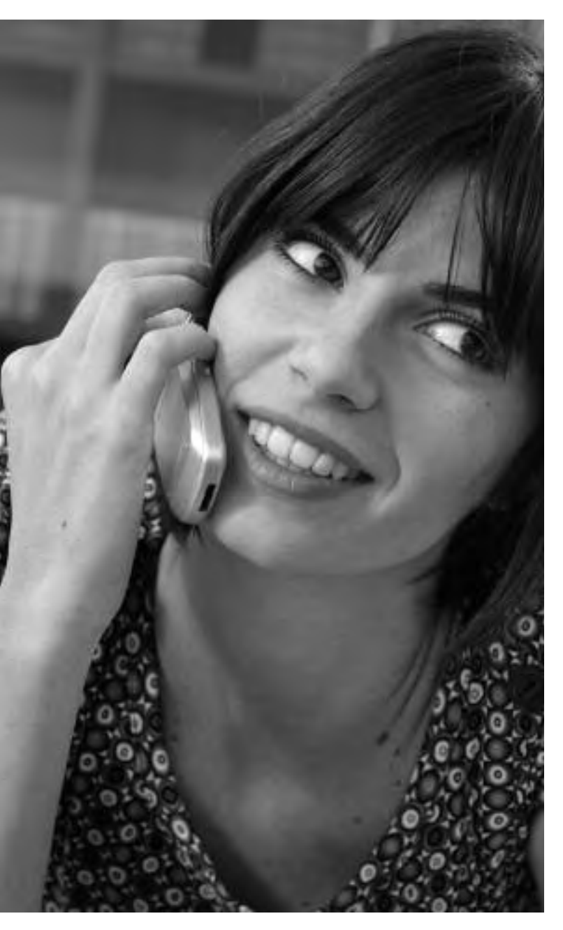
Creating the film of adaptation to life events is hugely demanding in terms of data. We need to see people before, during and after the event in question.

It is hardly surprising to hear researchers asking for more data. After all, if we don't know what is going on, how can we possibly pretend to make things better? But our joy at the continuing presence of the BHPS goes far beyond our general hunger for more numbers.