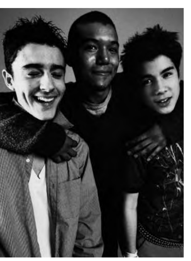
Can we find out how and why some young people beat the odds and, despite family disadvantage, go on to gain good educational qualifications?

Adolescence is often seen as associated with problems. But not all adolescents engage in risky behaviours and many of those who do so are involved in such behaviours only in a minimal and temporary way, and go on to become welladjusted adults and good citizens. How do we study risk and resilience in young people? Can we find out how and why some young people beat the odds and, despite family disadvantage, go on to gain good educational qualifications? How do we understand why children from apparently similar backgrounds differ so markedly in anti-social behaviour that puts them at risk? We need to look at young people as they grow up.