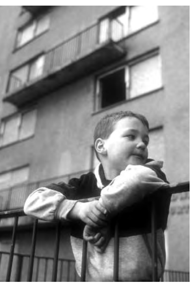
The dynamic perspective on poverty, rare two decades ago in Britain, is now widely accepted and has infused policy.

In the early 1990s, most analysis of Britain's income distribution and the extent of poverty was concerned with the dramatic increases in inequality and poverty that had occurred between the late 1970s and the late 1980s. But then in the 1990s inequality and poverty rates flattened off – it appeared that there was little or no change in the income distribution from one year to the next.