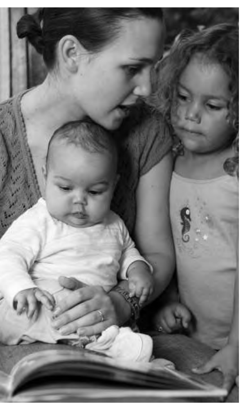
Only 35% of children born to a cohabiting couple will live with both parents throughout their childhood, compared with 70% of children born within marriage.

The value for policymakers and private sector decisionmakers of longitudinal data and analysis is illustrated here by an example central to current policy discussions of family life: the dramatic growth in the number of births outside marriage. Official statistics suggest one story. The BHPS uncovers the real story.