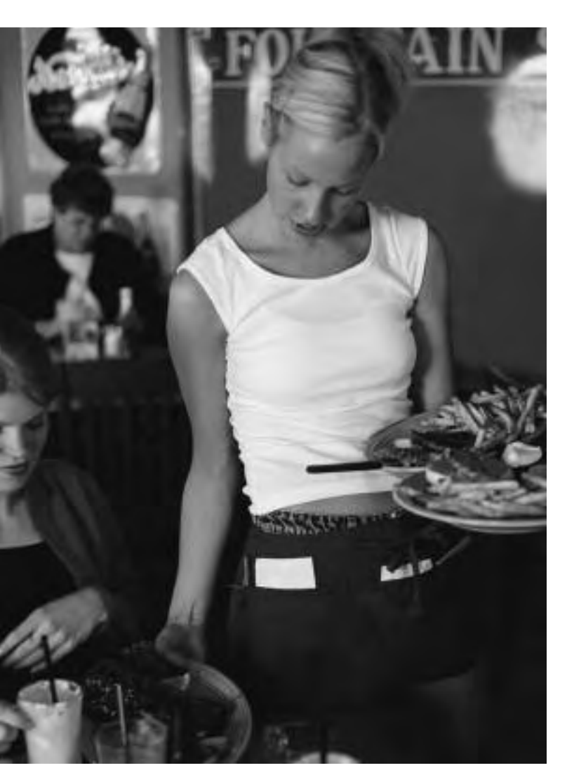
Panel data are crucial in understanding the complex processes surrounding transitions into and out of unemployment and insecure jobs.

During their working lives, people may experience a number of transitions: into and out of work; between jobs; pay rises or pay cuts. Panel surveys – the BHPS in Britain – have allowed analysts to observe the characteristics of people who experience such events, and the impact of the events on subsequent behaviour. Although panel data had been available in some countries, such as the USA and Germany, for several years, analyses of the experiences of British workers used to be limited as the same workers were not followed over time.