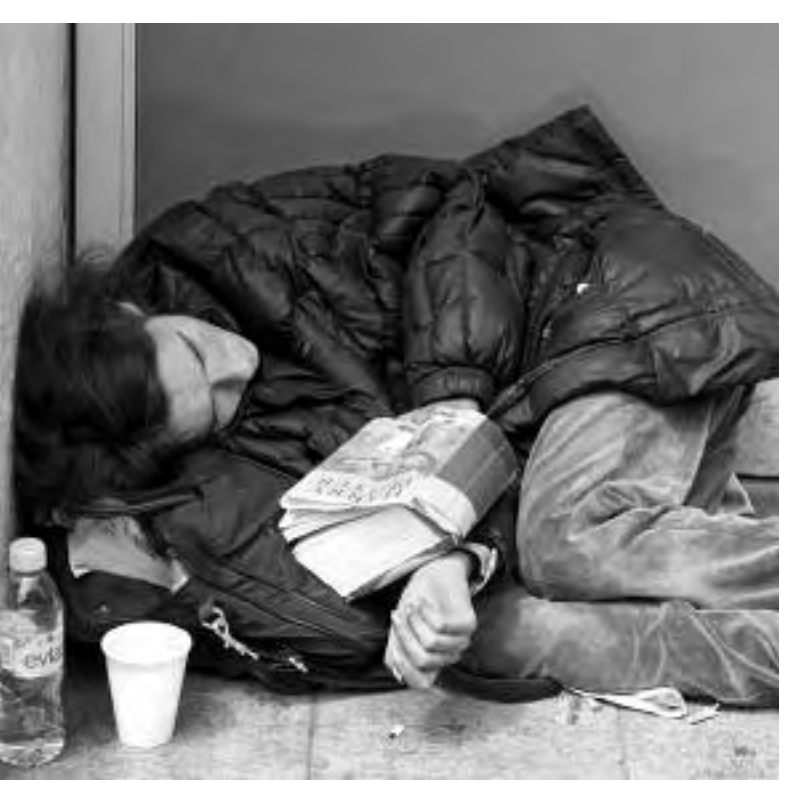
'Exclusion' and its counterpart 'inclusion' are words referring to processes. Their investigation needs us to follow people over time

Until the late 1990s, 'social exclusion' was an unfamiliar term in the UK. But after 1997 the phrase became much more common (although without universal agreement as to what it meant). For the government's Social Exclusion Unit set up in 1997 it was a '... short-hand label for what can happen when individuals or areas suffer from a concentration of linked problems such as unemployment, poor skills, low income, poor housing, high crime, bad health and family breakdown'.