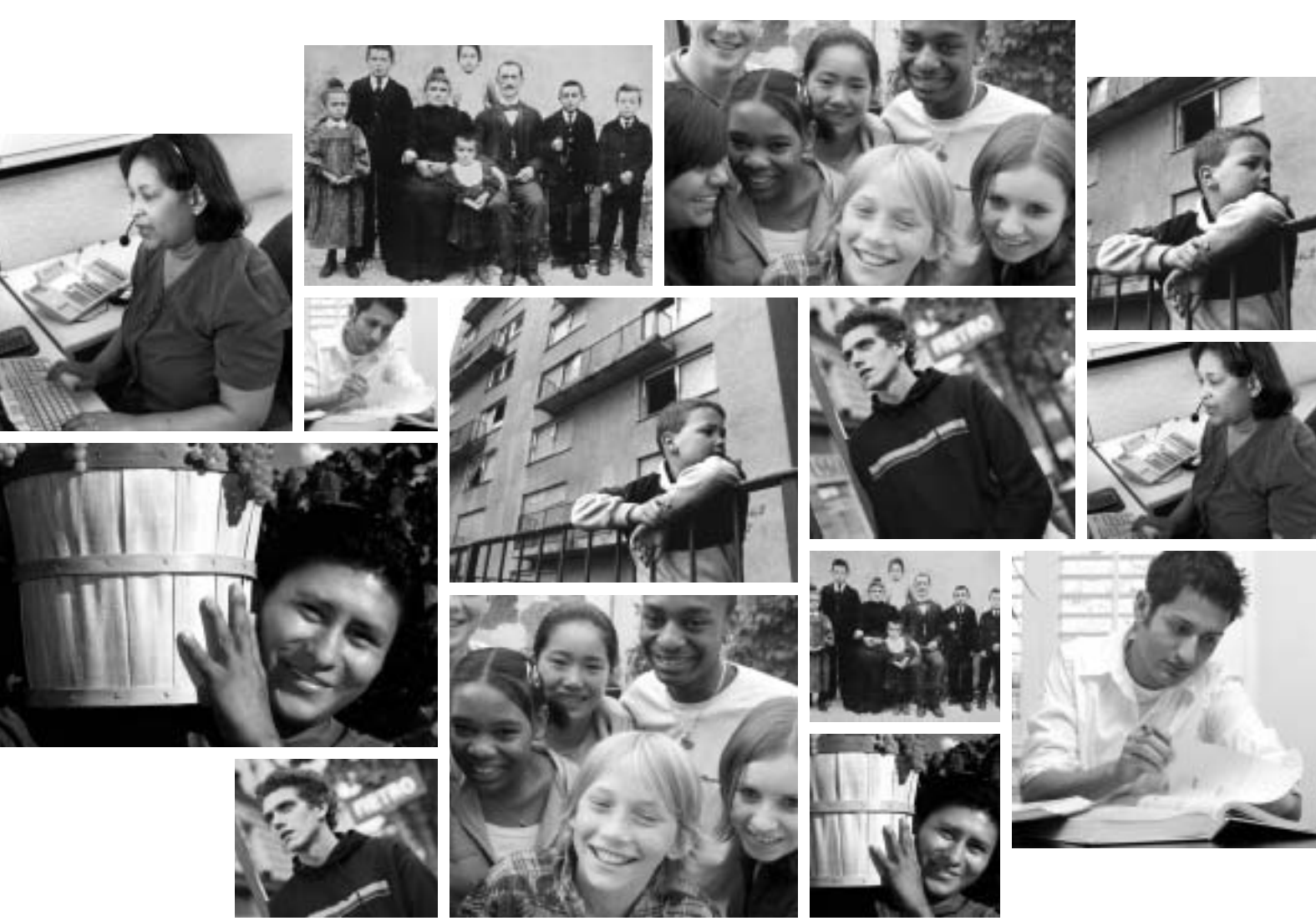
Taking the long view: the ISER Report 2006/7