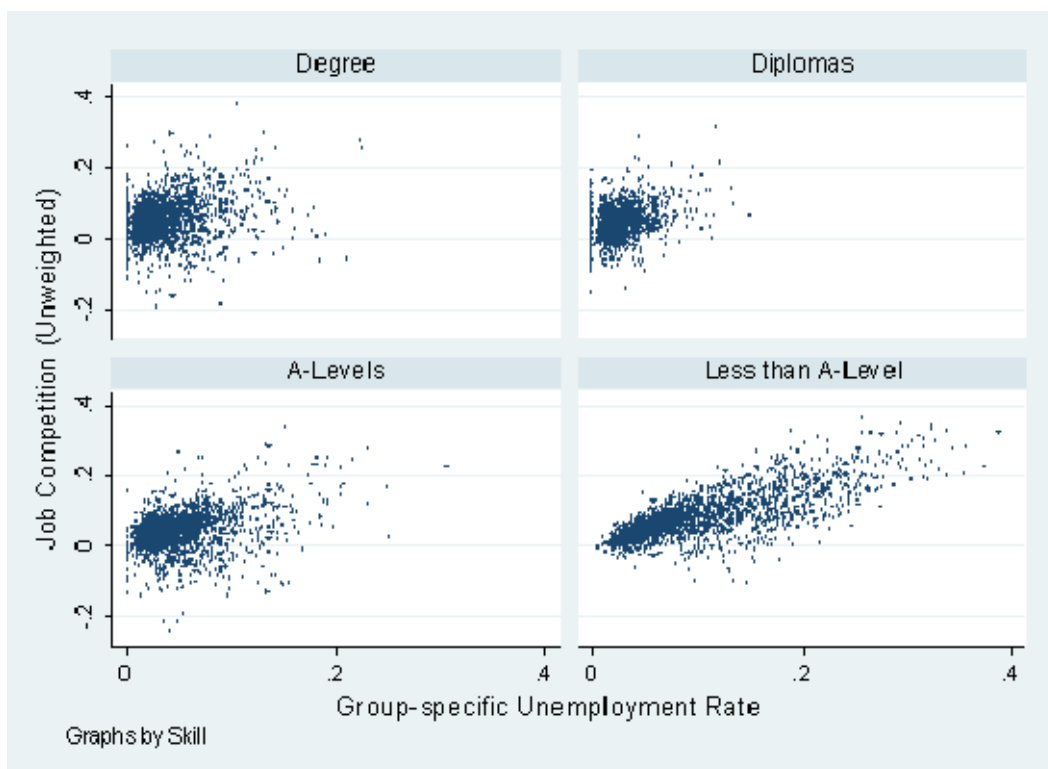
Figure 2: Correlation between the group-specific unemployment rate and the (unweighted) job competition measure by education groups