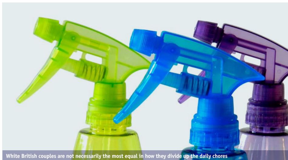
White British couples are not necessarily the most equal in how they divide up the daily chores