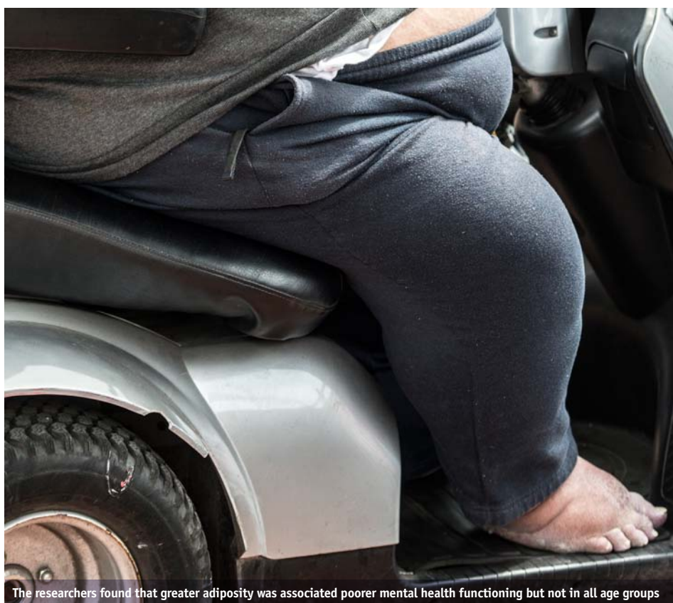
The researchers found that greater adiposity was associated poorer mental health functioning but not in all age groups

"We didn't see an association of adiposity and mental health functioning in young (under 30) or older people (over 50). The associations we see are restricted to the 'middle aged', which might explain why the literature is mixed. Further, in middle age having a chronic disease (cardiovascular disease, arthritis and endocrine disease) appeared to account for the association of BMI and mental health functioning. It might be because people with disease develop poor mental health and obesity or that obesity causes poor mental health and disease or that poor mental health causes disease and obesity – we don't know from these analyses but we concluded that clinicians should think about how these things are inter-related as each one is important in middle age." ●