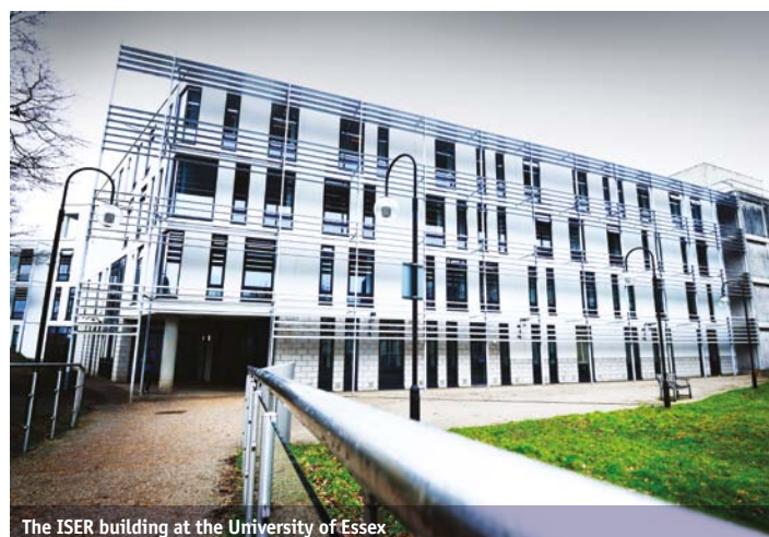
The ISER building at the University of Essex

“This supports the idea that, especially for ethnic minorities, the information and resources available in the community can provide support in finding good jobs... additional resources could be given to these vulnerable groups through employability programmes or guidance”