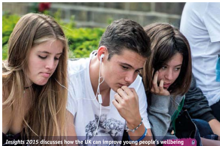
Insights 2015 discusses how the UK can improve young people's wellbeing

"Evidence drawing on the data can help to inform practitioners across many sectors, shape political and media debate and help academics and policy makers understand how UK lives are changing in response to our environment, jobs, government and behaviours"