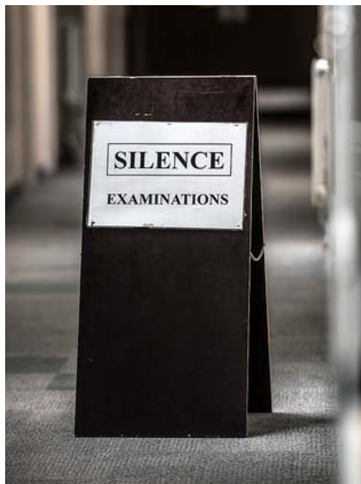
Researchers can now use the study's linked data to explore the connection between household characteristics and events and children's school records including exam results