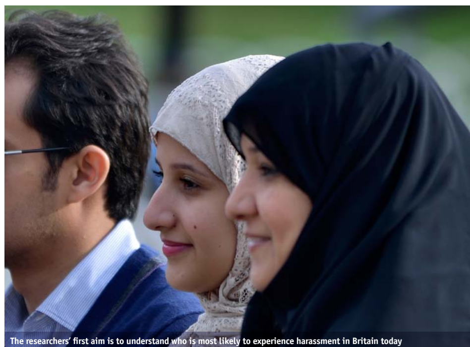
The researchers' first aim is to understand who is most likely to experience harassment in Britain today

Improving absolute levels of gender equality could save the lives of young girls and help redress India's birth gender ratio: in the 2011 census only 918 girls were born per 1,000 boys.