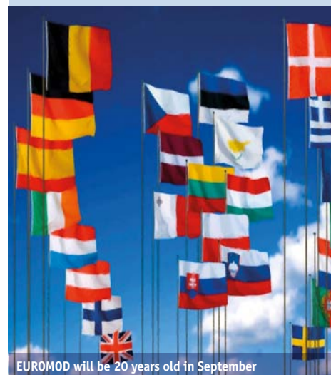
EUROMOD will be 20 years old in September

Please submit abstracts/papers to Iva Tasseva at itasseva@essex.ac.uk by 1 May 2016. We will respond by the end of May and circulate a draft programme shortly after.